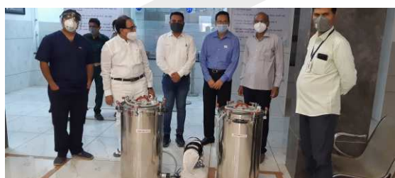
Autoclave and ogger