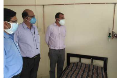
Installation of Oxygen Line to 90 Bed Covid Care Center at K J Polytechnic College Bharuch.