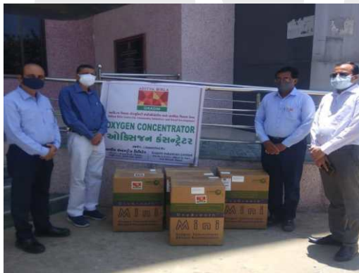
District Collector and SDM & Sr. Vice president - Grasim Bharuch