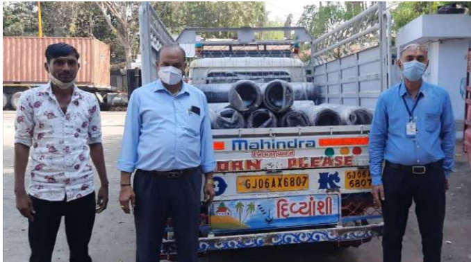
Oxygen Cylinders to Civil Hospital, Vyara.