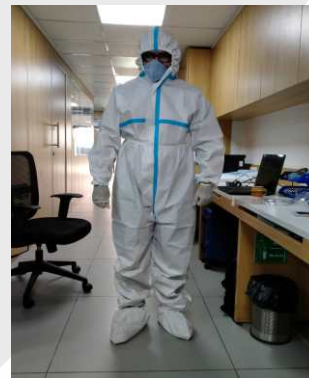
3000 Nos. of PPE Kits to Civil hospitals, Bharuch