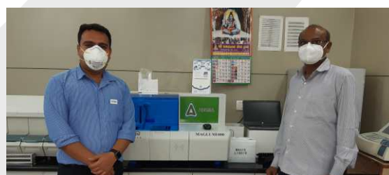
Maglumi Test Device