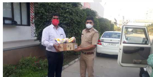
Donation of Hand Sanitoser, N-95 Masks to Police Station, Vagra