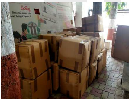
1000 Nos. of Dead body Kits to Civil hospitals, Bharuch