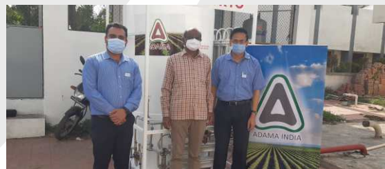
Liquid Oxygen Tank