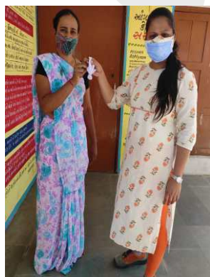
Covid relief remedy – Potlis ( Mini bags – A Cube of camphor & a spoon of carom seeds AZWAIN) distributed in nearby community