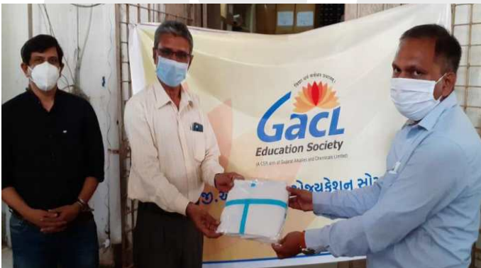
3000 Nos. of PPE Kits to Civil hospitals, Bharuch