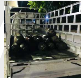
Donation of 15 Beds and 32 nos 7 Kgs Oxygen Cylinders, 2 Nos. Oxygen Concentrators to 100 Beds Baccho Ka Ghar Covid Care & Isolation Center, Vagra 4 Beds to Isolation Center- Ankot Village 5 nos 7 Kgs Oxygen Cylinders to Covid Care Center, Kumar Shala, Vagra