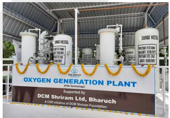
O2 plant: ESIC Ankleshwar