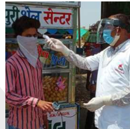
Conducted Screening for Covid-19 at Vagra Market and Vilayat Sunday Market in co-ordination of Mamlatdar Office, Vagra