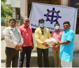
Dahej Sarpanch (Extreme R) receiving kit