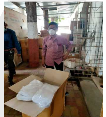
1000 Nos. of Dead body Kits to Civil hospitals, Bharuch