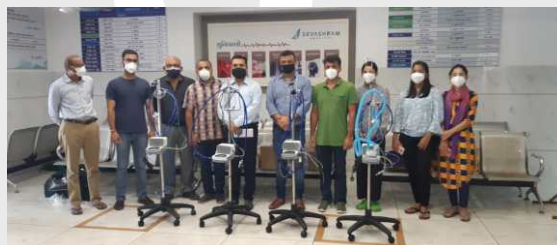
High Flow Nasal Oxygen Device