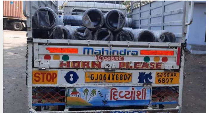
Oxygen Cylinders to Civil Hospital, Vyara.