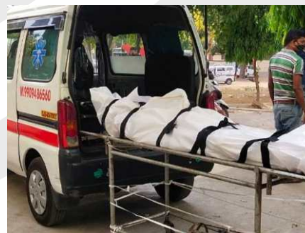
1 Ambulance service at SSG Hospital, Vadodara for COVID-19 patients