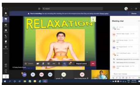
Various Webinars for Spouse of Employees