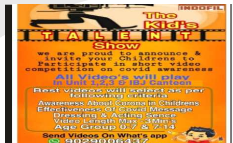
Short Video Competition for Kids of Employees