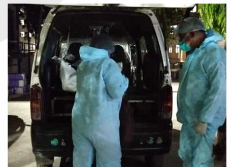
1 Ambulance service at SSG Hospital, Vadodara for COVID-19 patients