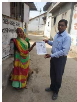
Awareness campaigns in Nearby villages