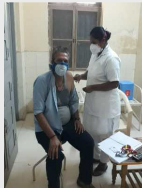
Covid Vaccination Camp