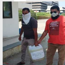
Donation of Sodium Hypochlorite Solutions – 1000 ltrs Hand Sanitizers – 100 ltrs to 100 Beds Baccho Ka Ghar Covid Care & Isolation Center, Vagra 30 Bed Covid Care Center at Kumar Shala, Vagra