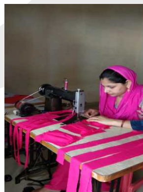
Made by Cloth facemasks