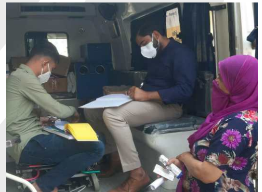
Health Care & Covid Awareness