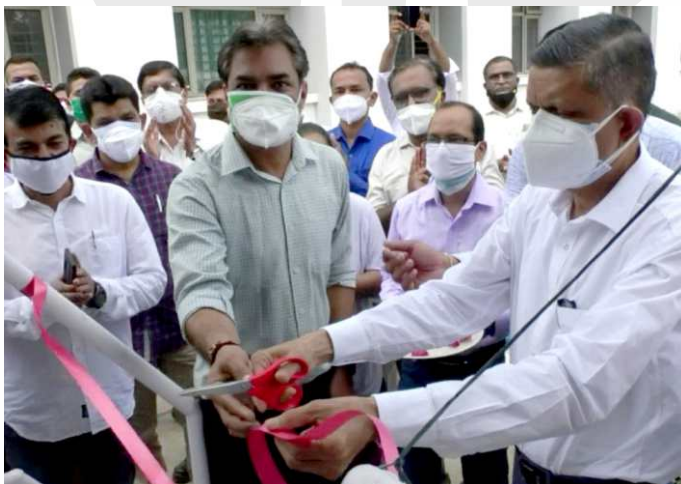
O2 plant: ESIC Ankleshwar