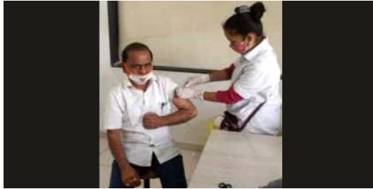
Organised total 4 Vaccination Camp at Vilayat GIDC - more than 400 people vaccinated