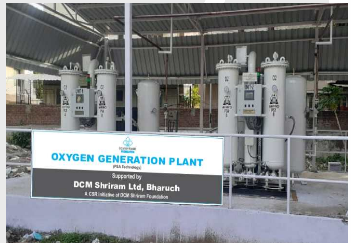
O2 plant: Civil Hospital, Bharuch