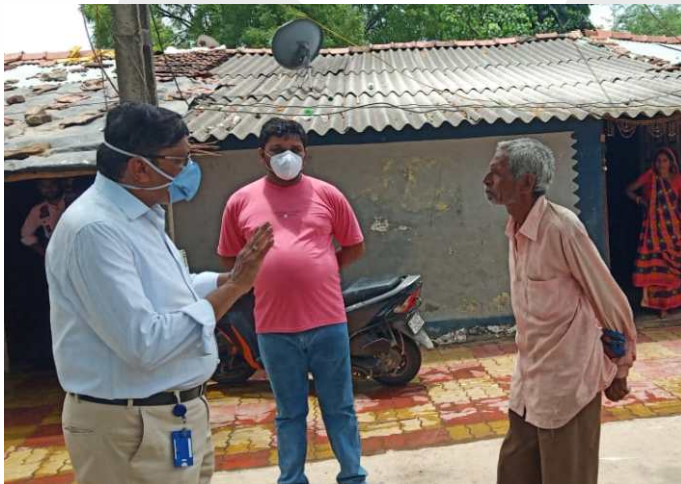
Awareness on Vaccination